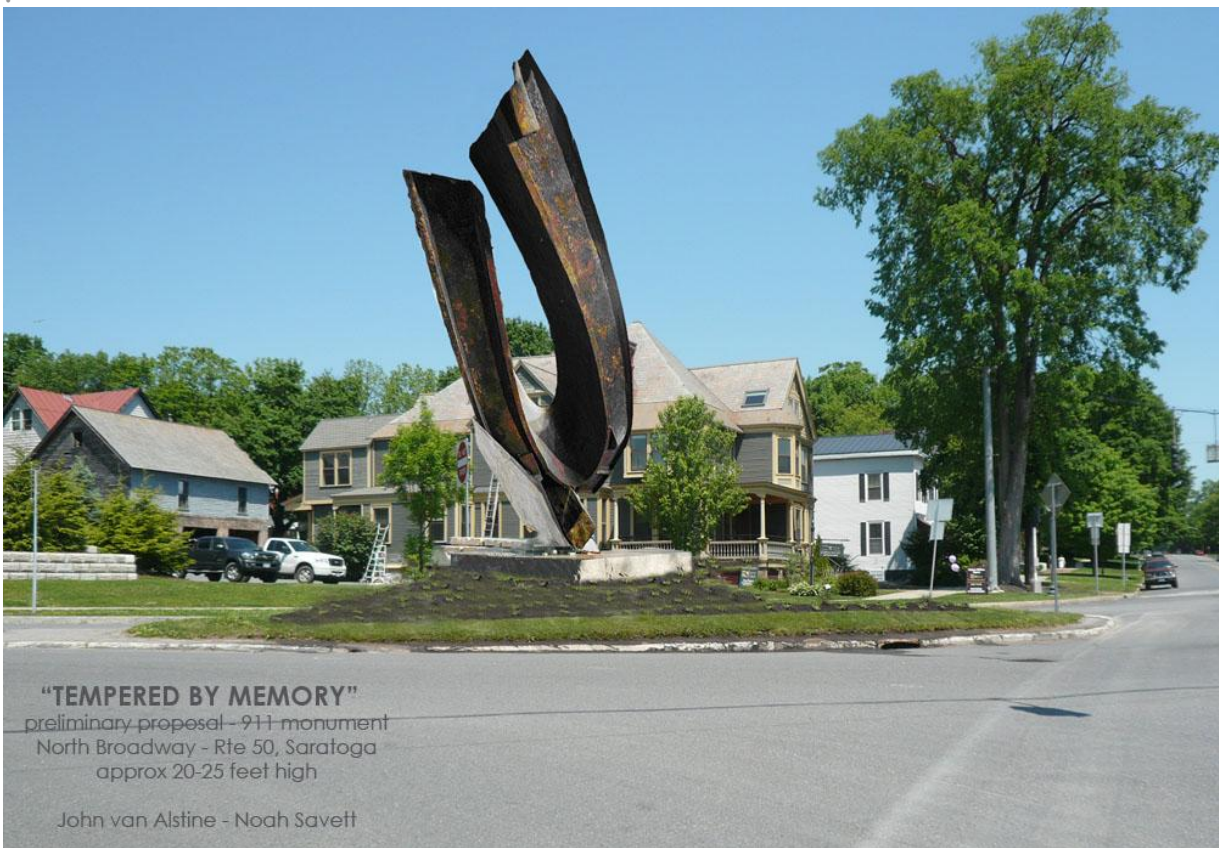
"TEMPERED BY MEMORY" preliminary proposal - 9/11 monument North Broadway - Rte 50, Saratoga approx 20-25 feet high